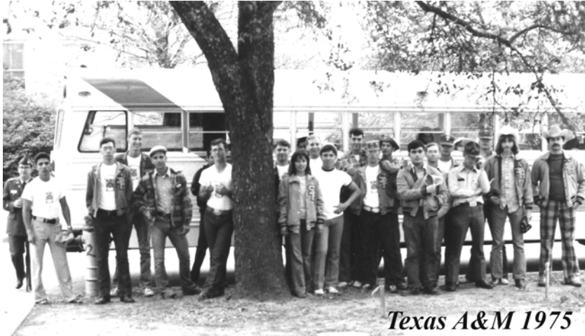
Texas A&M 1975

singing and guitar—he knew " the words to about a million tunes. " Floyd not only knew the " Sons of the Pioneers ", he knew their grandparents. The audience on the bus included the car load of co-eds that were picked up along the road. A young man of the team was assigned the task of