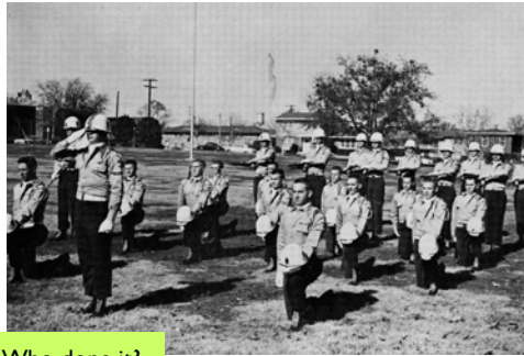
Who done it?