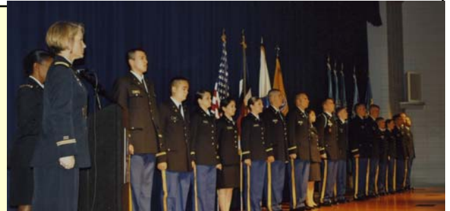
The Largest Graduating Class in Years!