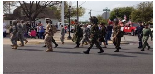
Medal of Honor Parade