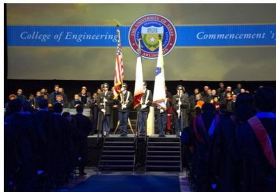
Color Guard at Commencement