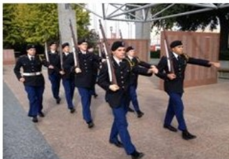
SHR at the 26 th Annual Run to the Texas Vietnam Memorial