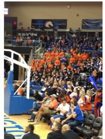
MavCav at Homecoming