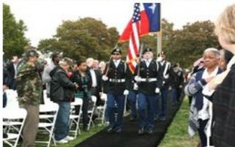
Color Guard at UTD's Wall That Heals Ceremony