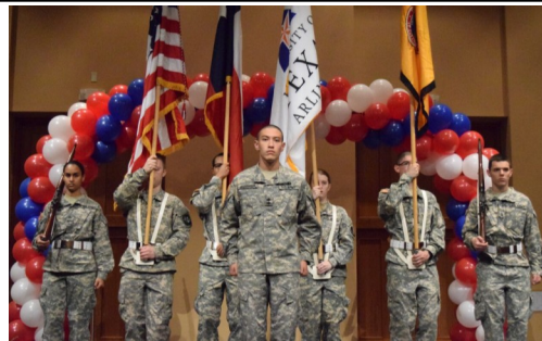
The Cadet Corps Color Guard at the Hall of Honor