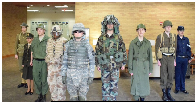
The Cadet Corps "I Am A Maverick" Team

Most alumni do not realize that a major part of the Hall of Honor is planned, put together, and conducted by the Corps of Cadets. It is one of the major learning experiences in the spring semester. The Corps staff provides a basic outline for the Hall of Honor in December. It identifies for the cadets what is expected of them, the teams they might need to accomplish the event, and things they can do early on in preparation. The staff identifies the Cadet Officer In Charge (OIC) who will be the main point of contact with the CCAC. About a month prior to the Hall of Honor there is a joint planning session between the CCAC and the cadets. Some of the teams that take part in this meeting are: the Corps Commander and OIC along with cadets leading teams for Color Guard, I Am A Maverick, Carlisle Cannons, Sam Houston Rifles, registration, escorts for honoree families, audio visual, Silver Cup detail, directional guides, decorations and memorabilia, seating and table arrangements, and members of the Military Science Department Cadre.