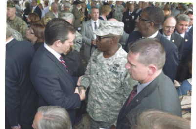
Below, the Old Men show 'em how it's done at the HOH.