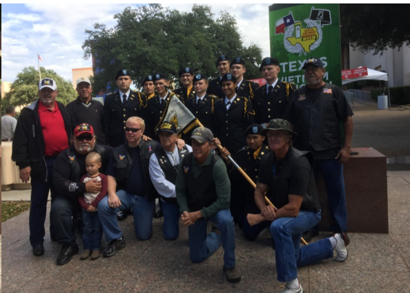
The UTA Sam Houston Rifles performed at the Texas Vietnam Memorial for the Run-to-the-Wall event on Veteran's Day. They met with veterans after the ceremony.